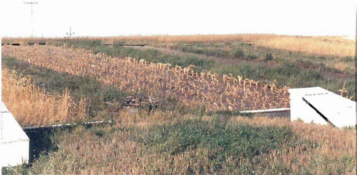
Plate 6. Sediment collector traps at the base of the slope. W. Michalyna