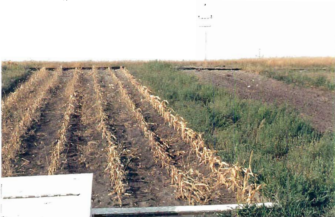
Plate 9. Standard research plots with varying amounts of surface plant residue and sediment traps with collectors at base of slope.