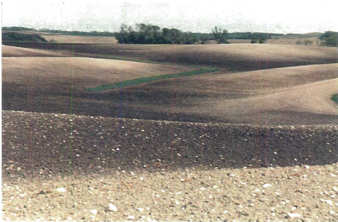
Plate 11. Scalping experimental plots to assess the impact of loss of top soil on crop productivity.