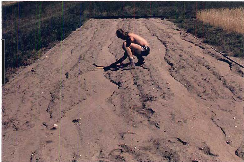
Plate 7. Bare soil surface cultivated up and down a 9% slope - a worst case scenario for risk of erosion.