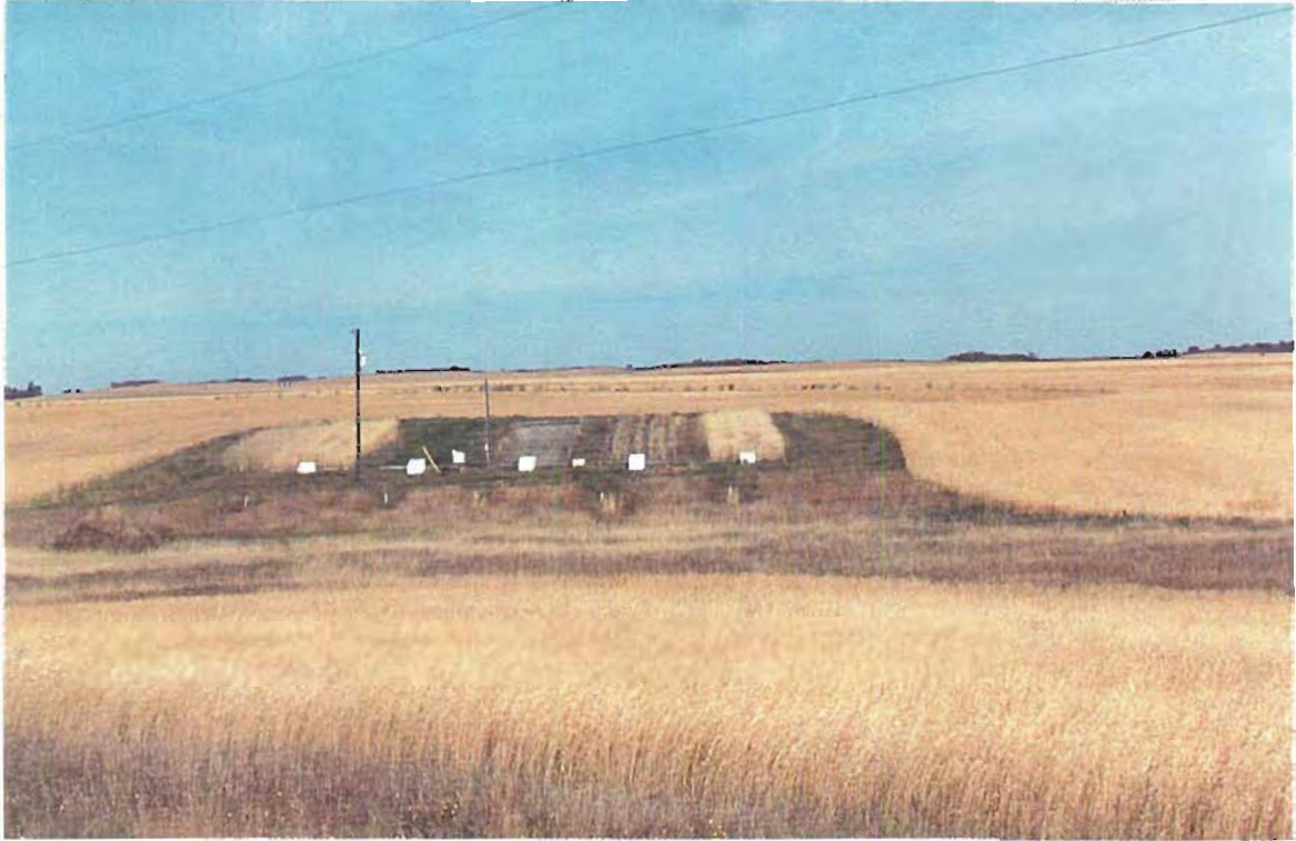
Plate 5. Wischmeier research plots with different crop management on 9% slopes 22.5m long. W. Michalyna