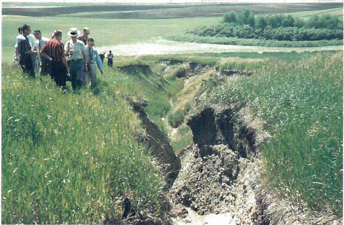
Plate 3. Gully erosion from snow melt and spring runoff.