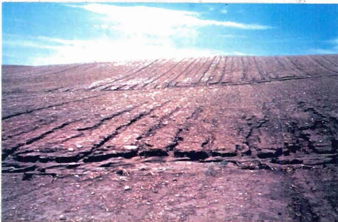
Plate 1. Sheet and rill erosion on slopes with emerging crops, erosion deposition at base of slopes. (Till soils with steep slopes).