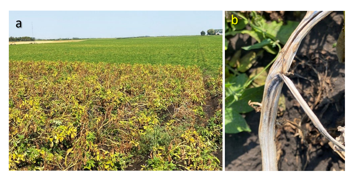
Fig. 3.a, b) Potato Early Dying (PED) is becoming more severe in high stress areas especially in high spots in fields; b) both Verticillium wilt and black dot disease are now easily seen in the fields.