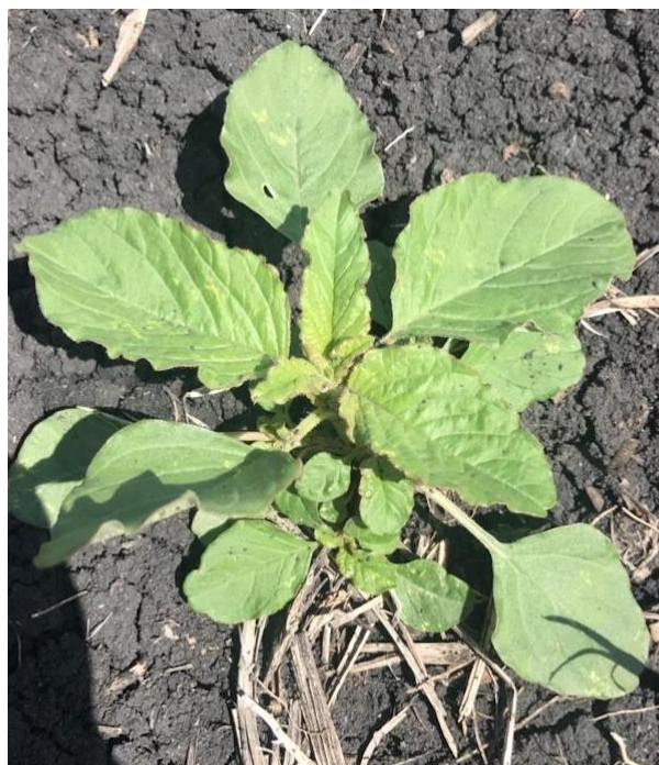
Slow acting herbicide on redroot pigweed.

There are a number of cases of redroot pigweed that weren’t controlled as quickly as some would hope with various herbicides this year. While there have been some cases of confirmed Group 2 resistance in redroot pigweed that may not always be the situation. Slow growing plants take up less herbicide, are able to metabolize some or all of it before it reaches the growing point, and then manage to survive the herbicide application. Even glyphosate applied before the rain in certain areas, was very slow to work on redroot pigweed but if there was some rain and then a herbicide application, the effects were much more noticeable. If normally susceptible weeds survive and manage to set seed, a herbicide resistance test could provide valuable answers for future weed control.