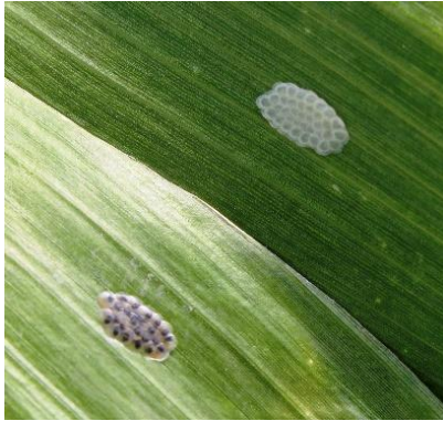
European corn borer egg masses – recently laid (upper) and closer to hatch (below)

Armyworms: Some high populations of armyworms ( Mythimna unipuncta ) have been reported in fields of small grain cereals and forage grasses in the Eastern, Central and Southern Interlake regions.