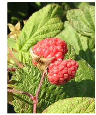
Double berry formation typical in Double Delight raspberry.

Autumn Britten and Double Delight had the highest yields consistently over 3 years of yield data, all have very good winter hardiness. All were selected into the trial only list. No varieties could be recommended for large scale commercial planting with the lower yield results overall. The variety Red River was not tested